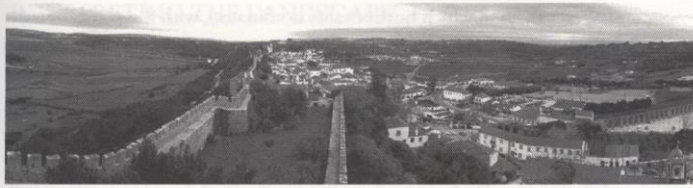
Figure 3: The historic centre of the town of Óbidos and surroundings.

the logistic capacities of the area. This is a problem of contents, specialities and meanings which exceed the ecological, historic-cultural and aesthetic limits of the landscape that are connected to the patrimonial specificities and the memory of a people.