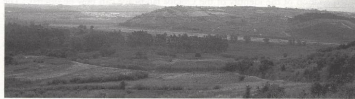
Figure 5: The horizontality of the main valley.

It is vital to respect and value the visual and/or symbolic power associated with some elements, structures or groups. Distinctive characteristics include the articulation, or interruption, of volumes that are distinct entities, as well as the open interstitial spaces of articulation and transition between dominant areas. Specifically, this refers to the imposing presence, either isolated or in groups, of some land relief, water and some groups of houses and architectonic elements. The wide and flat convexities that are characteristic of limestone relief and the impressively open valleys emphasise horizontality (Figure 5).