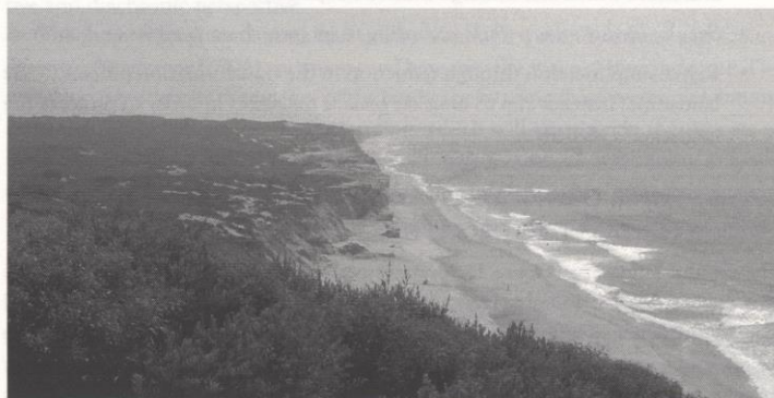
Figure 2: The coastal platform and the shoreline of Óbidos.

of tourist resorts and secondary residences. This situation is the result of the territory's proximity to the coast and the metropolitan area of the capital (Lisbon), a relationship that surely contributes to the emblematic character of the town of Óbidos. The extensive pine and eucalyptus forests mainly occupy large properties, probably because of the poor soil quality. Agriculture is found on small and medium-sized properties, which are intensively irrigated when located on the plains of the most fertile valleys. Inland, where the soil allows, agriculture extensively occupies the territory with emphasis on irrigated orchards and annual rain-fed foodcrops.