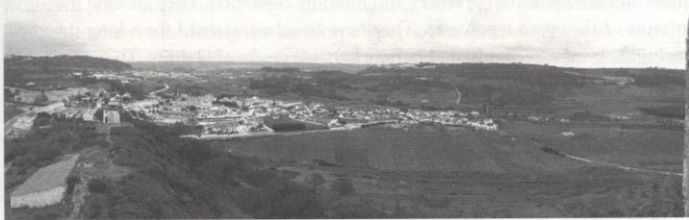
Figure 7: The transition area next to the town of Óbidos.

also concluded that those units usually lie within another area, called a 'unit of transition'. This term relates to the concept of fluid space, where the attributes overlap and the structural continuities of the landscape are established.