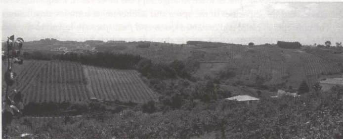
Figure 4: Pattern within the agrosystem.