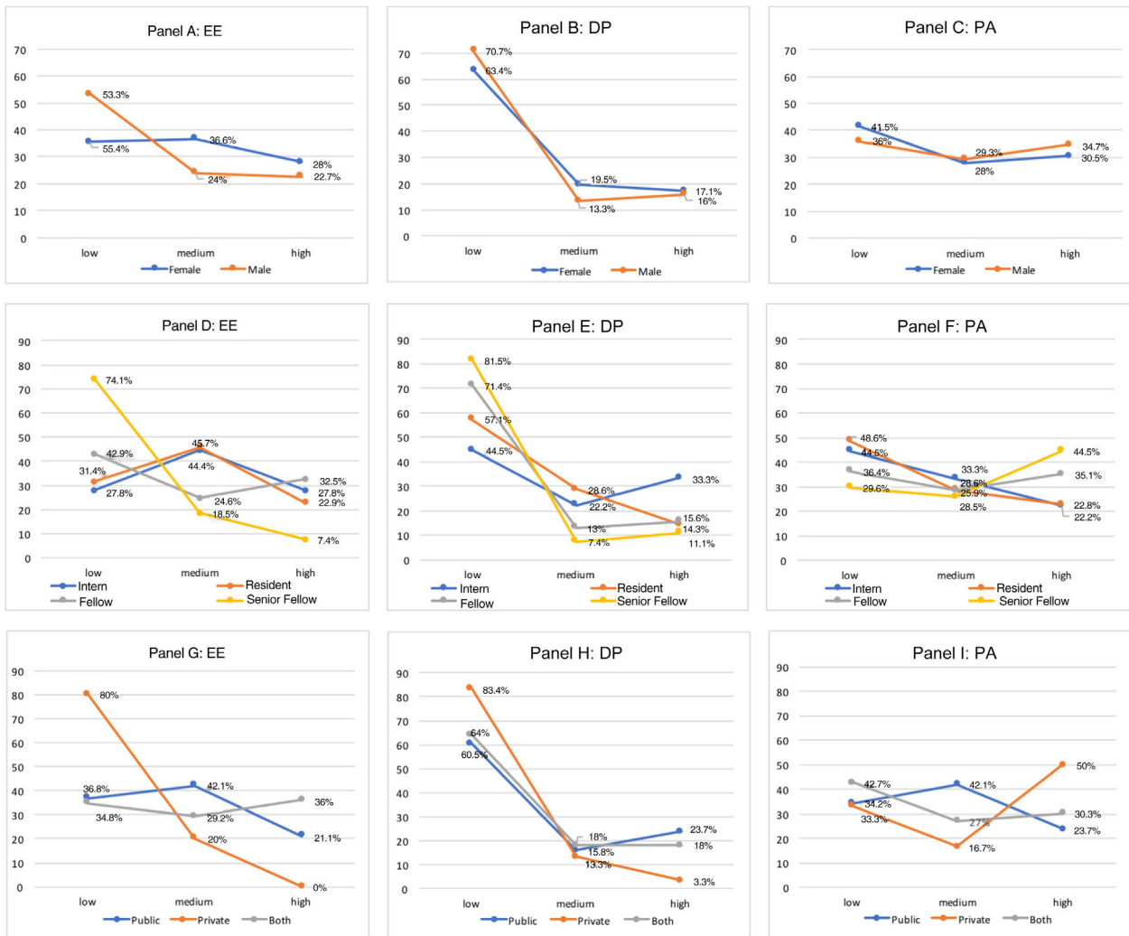
Figure 3 Levels of burnout dimensions by gender, professional level, and sector. DP: depersonalization; EE: emotional exhaustion; PA: personal accomplishment.

goal, sociodemographic, professional, and health-related data were analyzed.