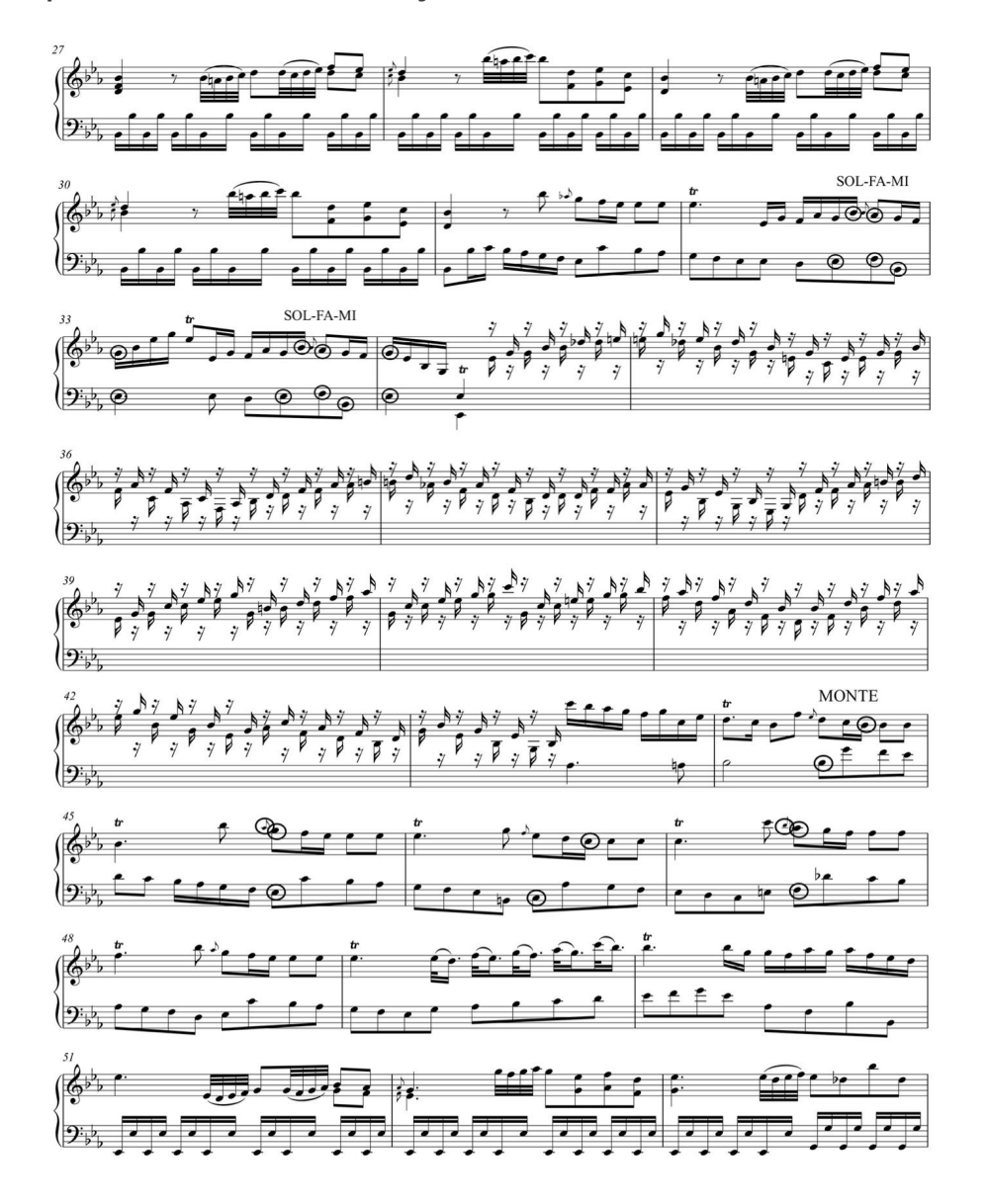
Example 4. Sonata in E flat major (no. 15), first movement, mm. 27–53.

Source: Author's transcription from edition 137-I-13, fols. 33–34 in the Biblioteca da Ajuda. Image description: Features of the galant style.