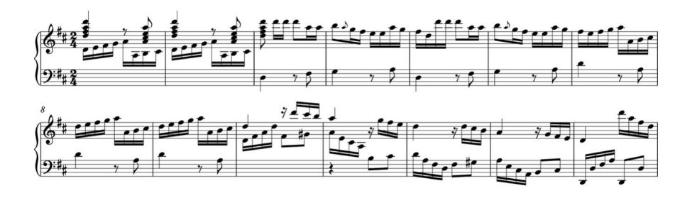
Example 2. Sonata in D major (no. 13), first movement, mm. 1–14.

Image description: Primary theme preceded by a preparatory module (mm.1–3.25).