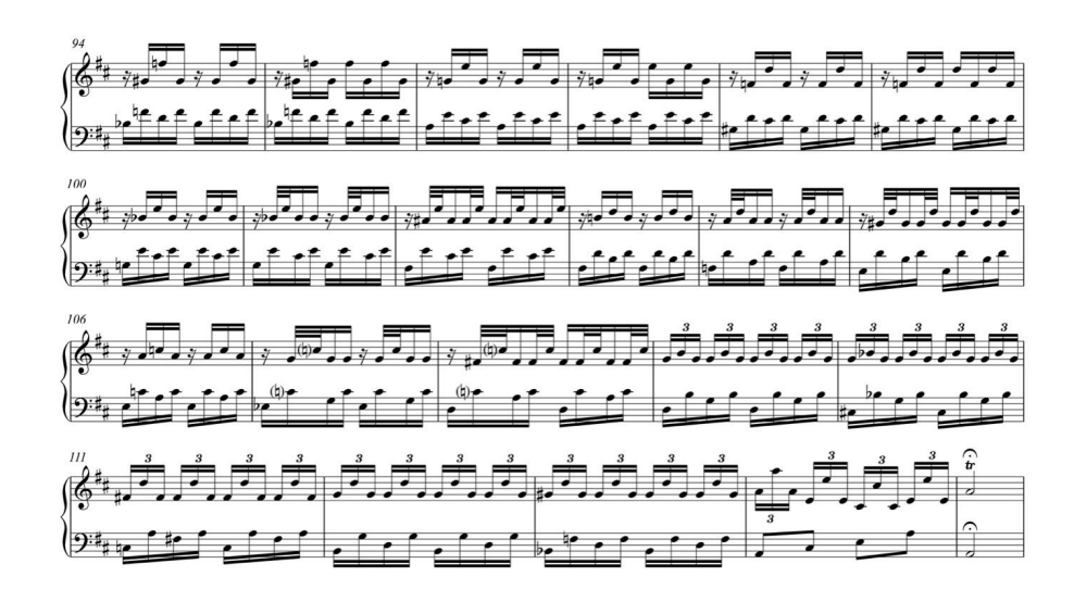
Example 3. Sonata in D major (no. 13), first movement, mm. 94-115.

Image description: Vamp in the development section.