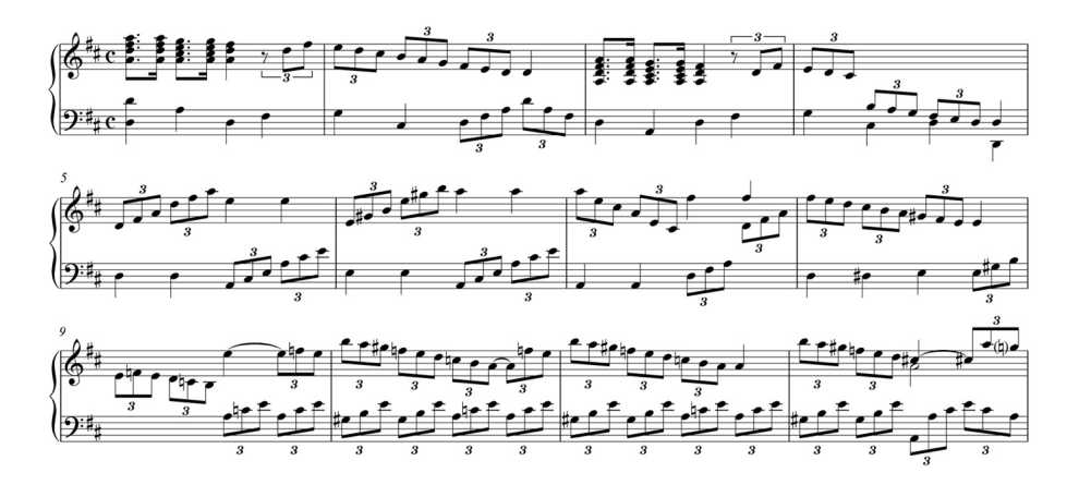
Example 7. Sonata in D major (no. 10), mm. 1–12.

Source: Author's transcription from manuscript Vm<sup>7</sup> 4874, fol. 55[54]v in the Bibliothèque nationale de France.<sup>23</sup> Image description: Excerpt of the exposition.