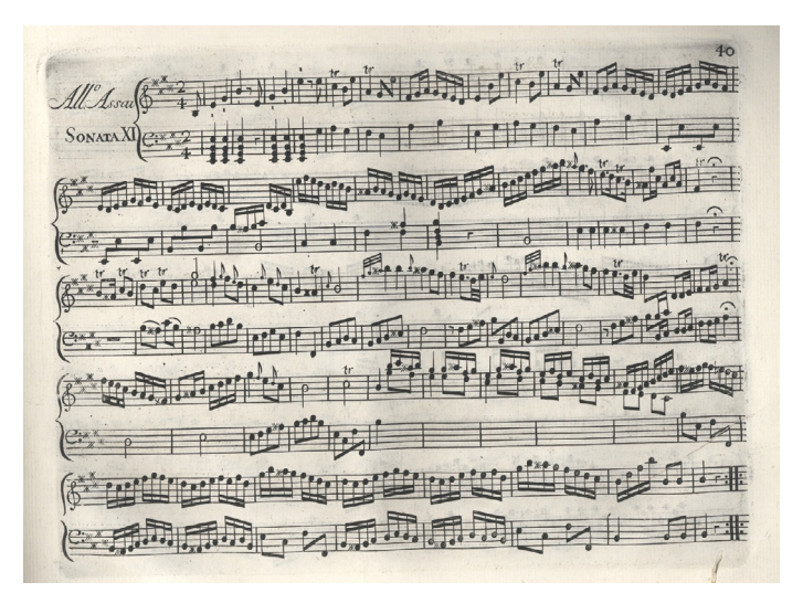
Figure 1. Sonata in E major (no. 16), first movement, mm. 1–58.

Source: Dodeci sonate, variazioni, minuetti per cembalo (Lisbon: Francesco D. Milcent), Biblioteca da Ajuda, 137-I-13, fol. 40. Image description: Two-part exposition with the medial caesura at the end of the second system.