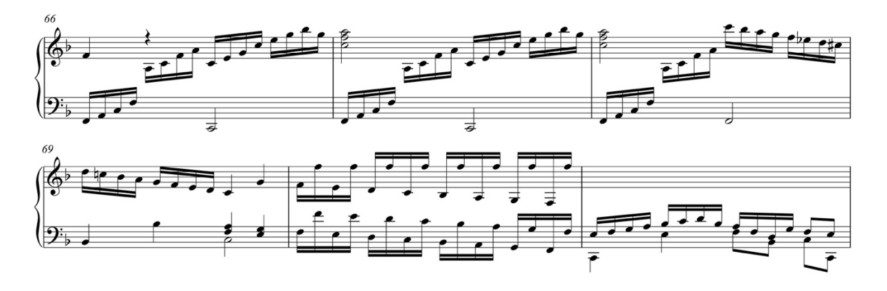
Example 12. Sonata in F major (no. 17), mm. 66–71.

Image description: Excerpt of the recapitulation.