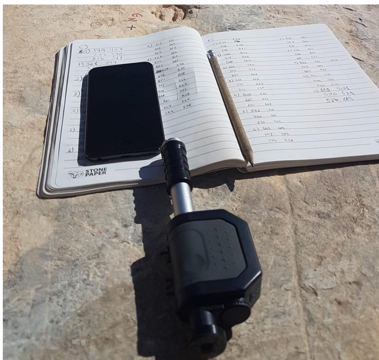
Figure 1: Leeb Hardness Tester equipment.

To understand the distinctive values for each marble variety found in the quarry, a set of measurements was carried out on each lithotype: White, Pink, Ruivina and Pele de Tigre marbles, dolomitized domains (in which the breccia cement and clasts are distinguished), quartz veins in silicified areas and green silicate banding, present in the pink marble. After collecting in situ data in each lithotype, measurements were carried on most significant rock-forming minerals: quartz and calcite.