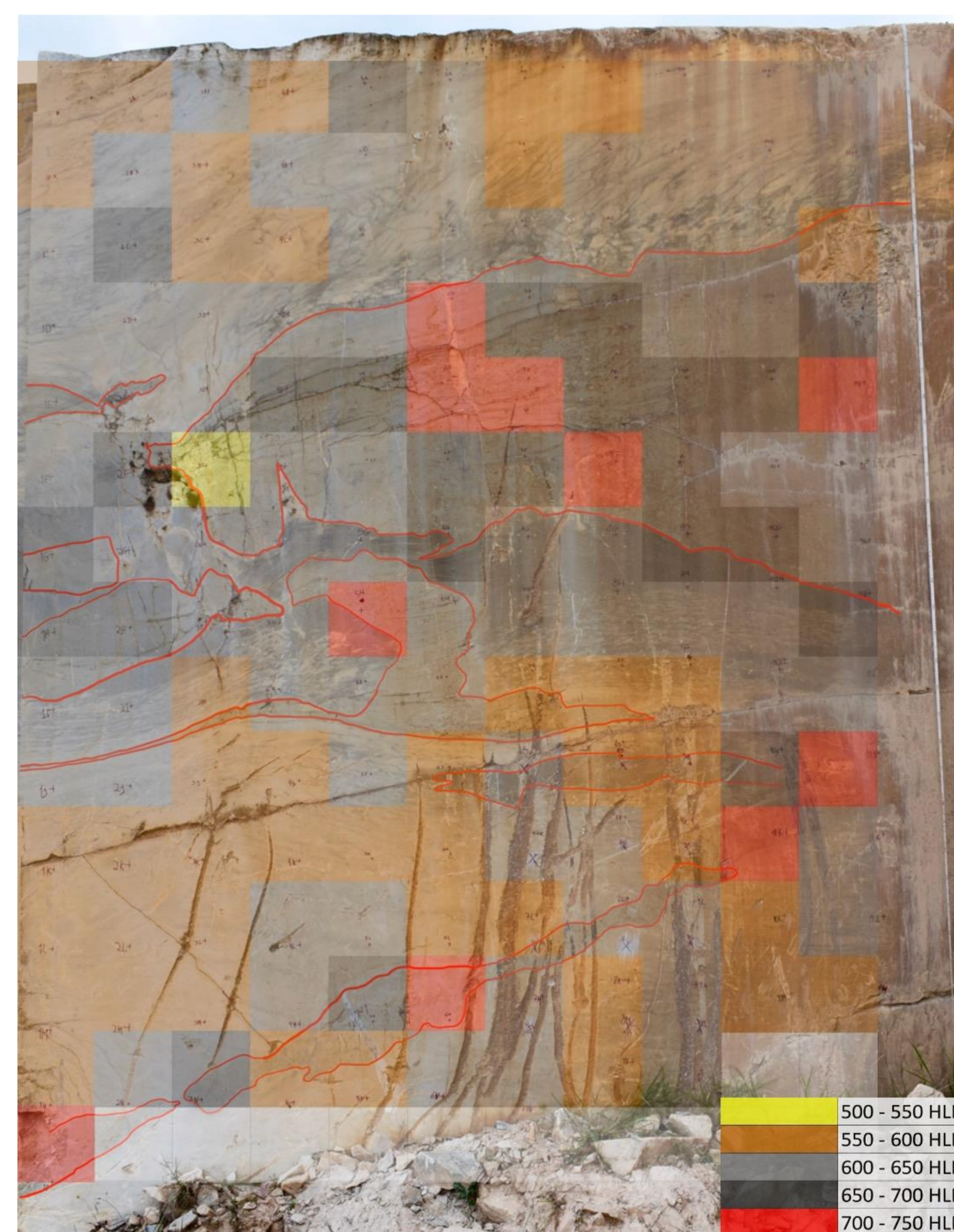
Figure 3: Marked quarry front with identified lithologies and HLD values corresponding to each grid point.

A quarry front with varied lithologies was chosen where a 30x30 cm grid was marked, with a total length of 4,80x4,50 m. At each grid point, 6 measurements were taken around it and the HLD hardness value of each point corresponds to the average of the 6 measurements. The front consists of white marble and Pele de Tigre marble, with silicified domains with quartz veins and breccias.