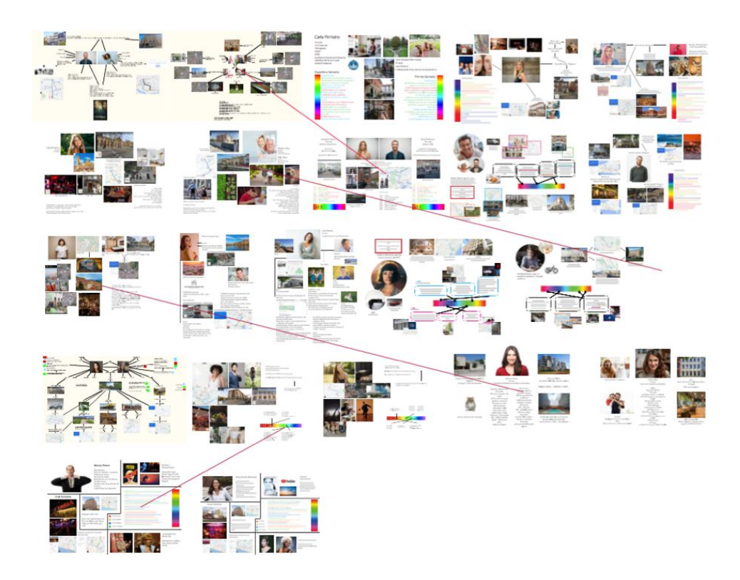
Figure 3: PMVC general map containing connections between boards.

projects, supported by a problem discovery and its ecosystem (stakeholders' and external variables), ranging from the issue of health care and sensory stimulation to the feasibility of a commercial product, from those, two are summarized in this article.