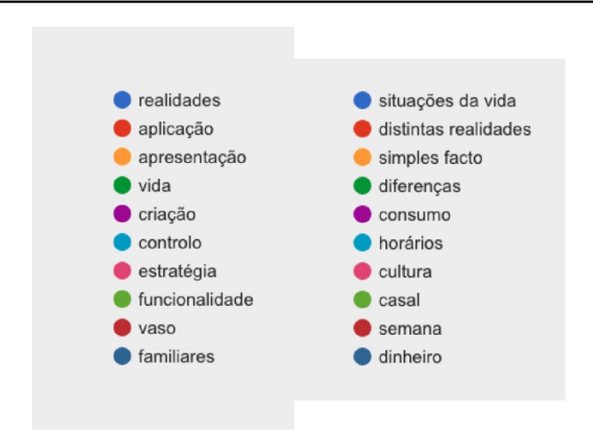
Figure 2 : Ranking of Informative keywords retrieved from the first assessment before the project development, left column. Ranking of informative keywords retrieved from the last assessment after the final submission of the project, right column.