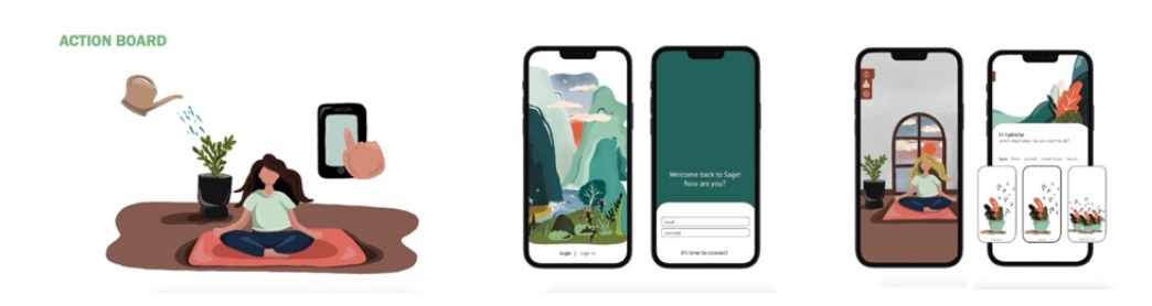
Figure 5: Project SAGE, developed by the students Catarina Couquinha and Filipa Batista.

From the submitted projects related to health care, the project ELIQU-ARE, emphasizes the PLAVESO functionality on the improvement of the air quality and sensory stimulation to residents in elderly residences. The focus group of the project are elderly who are dependent on help from third parties, and the possible consumers consist of a public with elderly family members dependent on third-party geriatric services, Figure 4.