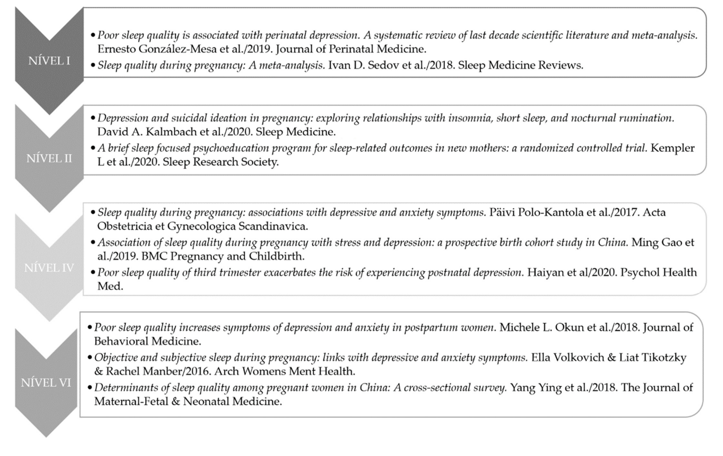
Figure 2. Included studies according to the hierarchical level of scientific evidence [11–20].

The selected articles were evaluated according to the level of evidence that they presented according to the hierarchical classification of evidence by Melnyk and Fineout-Overholt [10]: Level I—systematic review or meta-analysis; Level II—randomized controlled and well-delimited clinical trials; Level III—controlled clinical trials without randomization; Level IV—case–control studies and cohort studies; Level V—systematic, descriptive, and qualitative review studies; Level VI—descriptive or qualitative studies; Level VII—opinion of authorities and/or expert committee reports. Figure 2 shows the systematization of the included studies according to the hierarchical level of scientific evidence.