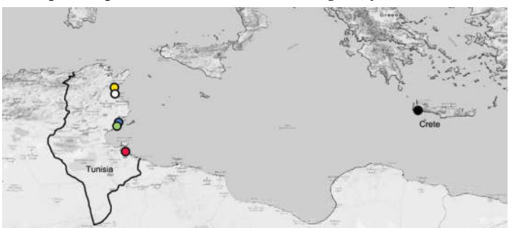
Figure 1. Main sampling regions of Tunisian and Greek Prays oleae utilized in this study. Red = Zazis, green = Chaffar, blue = Hajeb, white = Sidi Bouali, yellow = Bouficha and black = Crete.

Seventy-nine P. oleae specimens from Tunisia were sampled at five localities (Bouficha, Chaffar, Hajeb, Sidi Bouali, and Zarzis) and three specimens of P. oleae from Greece (that have emerged from olives collected in Crete island in 2019) (Figure 1). Tunisian specimens were sampled using commercial traps with specific pheromones (Biosani) during the year 2017.