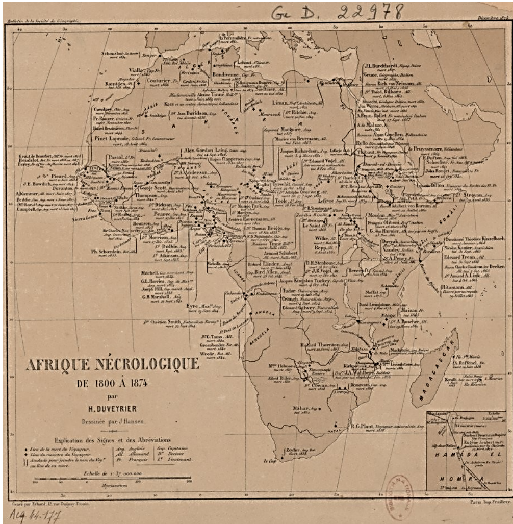
Figure 2. Map of “Afrique Nécrologique” by Henri Duveyrier.

are found on all three maps, which probably attests to the relevance of their contribution to the European knowledge of a portion of Western Africa.