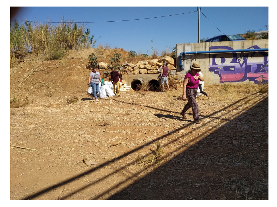
Fig. 3. Photo of the Action of cleaning the Rio Seco on September 26th 2018 (during Scientific Training Short Mission from Cost Action SMIRES by Pastor AV).