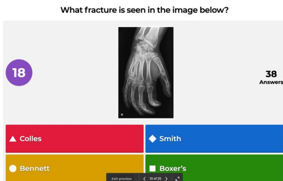
Fig. 2. Multiple choice question generated and made available to MIR students within the Kahoot environment, in the subject of methods and techniques in medical imaging.