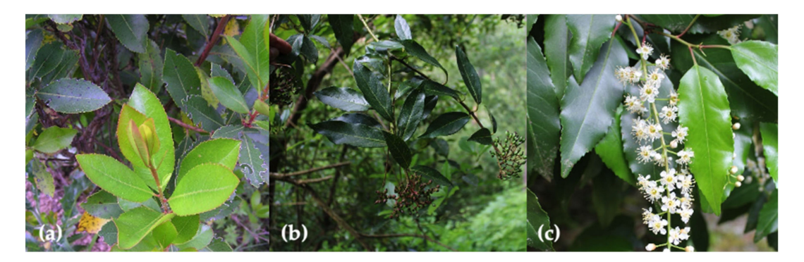
Figure 5. Pre-forested bushes with broad texture and slower combustibility. ( a ) Arbutus unedo; ( b ) Viburnum tinus; and ( c ) Prunus lusitanica .

Smaller shrubs are usually associated with the first stages of evolution of the vegetation cover. These plants often have a set of characteristics in common, specifically related to adaptation to water stress, such as the formation of spines, narrow leaves, having a leathery texture and being covered with hair, and in some cases the production of essential oils. These initial stages of the vegetation cover fall into phytosociological terms in the classes Cisto-Lavanduletea , Rosmarinetea officinalis , Calluno-Ulicetea and Cytisetea scopario-striati . On the other hand, larger shrubs have well-developed leaves, are wide and withstand half-shade environments (Figure 5). These characteristics are less prone to the advance of flames.