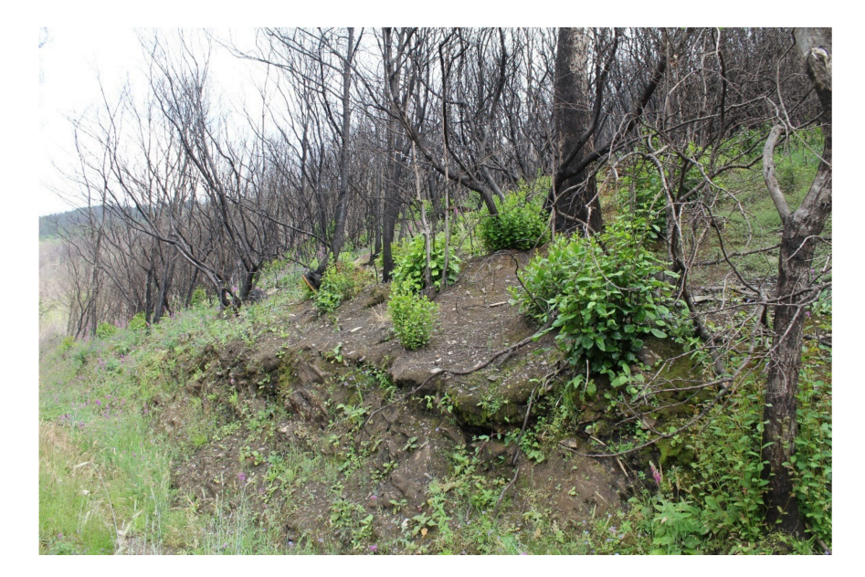
Figure 3. Vegetation regeneration nine months after a rural fire in Mata da Margaraça (Arganil, Portugal).

During a fire, the vegetation consumed more quickly by the flames corresponds to smaller materials, leaving (according to the intensity of the fire) coarser woody materials (Figure 3). In this study, it was observed that in the burnt areas of autochthonous hardwood forest in central Portugal in October 2017, the leftover woody materials of a smaller dimension were an average of 5 mm thick. All branches with a diameter greater than 5 mm were only scorched and did not burn completely. This result depends on a set of climatic variables and the type of existing vegetation. However, with a view to reducing the spread of fire, human action manages the type of vegetation cover better than climatic conditions.