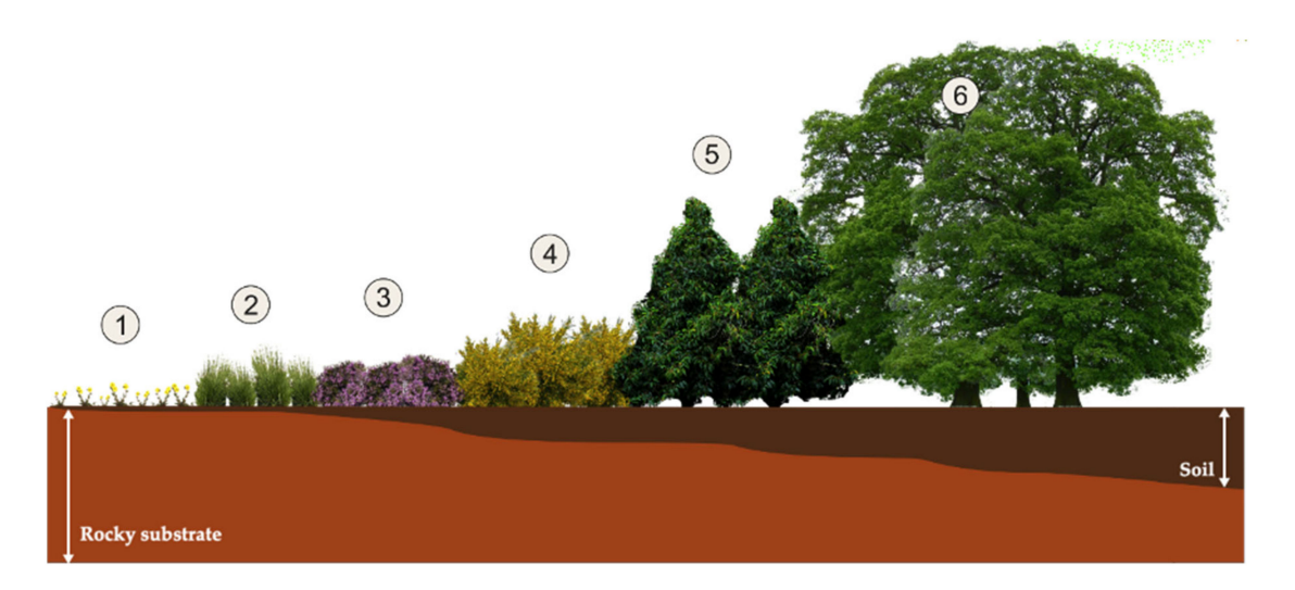
Figure 2. Dynamics of climatophilic vegetation in the Mediterranean: 1—annual grasslands; 2—perennial grasslands; 3—heathland; 4—broomland; 5—maquis scrubland; 6—forest (Author: M. Raposo, 2020).