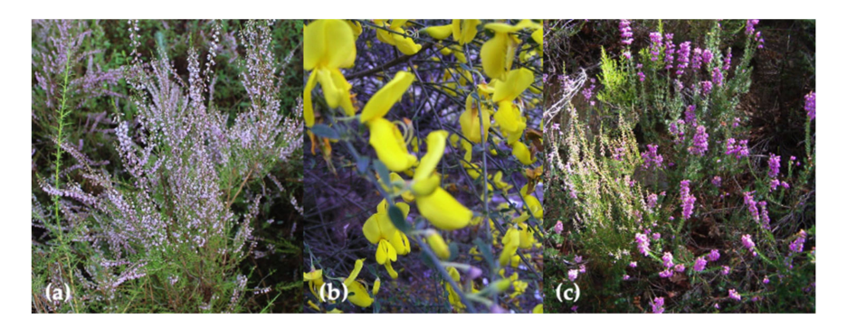
Figure 4. Heliophile shrubs with fine texture and fast combustibility. ( a ) Calluna vulgaris; ( b ) Cytisus scoparius; and ( c ) Erica cinerea .

This fact helps us to realize that the priority in the control of vegetation can and should be selective, contributing to the reduction of costs/time of management of the vegetation cover. That is, all shrubs of which the well-developed adult form has thin branches, with narrow, long leaves and covered with hair (usually gray-colored bushes and bushes with a fine texture) should be a priority in control actions (Figure 4).