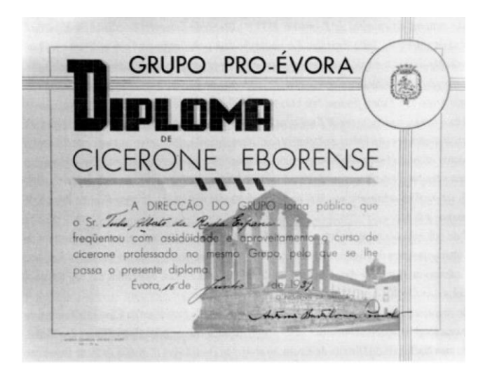
Fig. 3 - Évora Cicerone's Diploma, 1937. Issued by the Pro-Évora Group<sup>21</sup>

of the heritage of the city were carried out through the publication of articles by members in the local and national press; courses were held for cicerones in order to provide the information and training required for guiding visitors round the city.