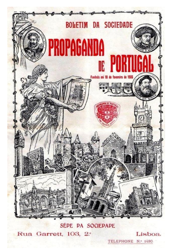
Fig. 1 – Cover of the Boletim da Sociedade Propaganda de Portugal, 1906

The society published a monthly Boletim, or review, to publicise its activities, which was distributed free to members. It was published until 1921, and from 1932. It featured suggestions for itineraries and tours in Portugal and information about the main sights in a number of cities, some texts accompanied by photographs.