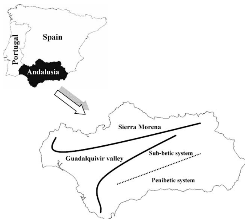
Fig. 1 Study area. Shown in schematic form are the main mountain ranges (Sierra Morena and the Betic System, sub-divided into two ranges, Sub-Betic and Penibetic) and the most important plain (Guadalquivir valley)

Forty-seven percent of the Andalusian surface area is used as agricultural land (Instituto de Estadística de Andalucía 2002). Olive groves (82% of the surface destined to