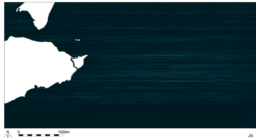
Figure 1 – Map drawn to illustrate the location of the Portuguese fortifications of Mazagan, Ceuta and Diu.