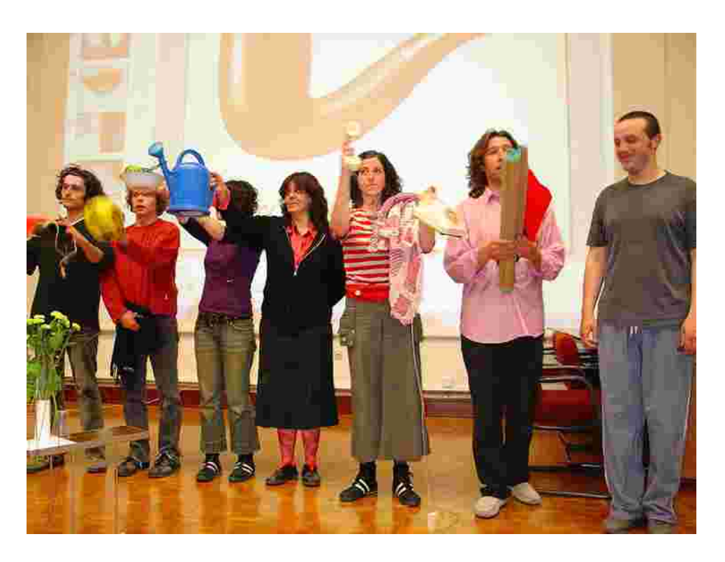
"Ceci n'est pas un...." performance with objects Theatre students in a interactive workshop - Conference in Lisbon (2003)