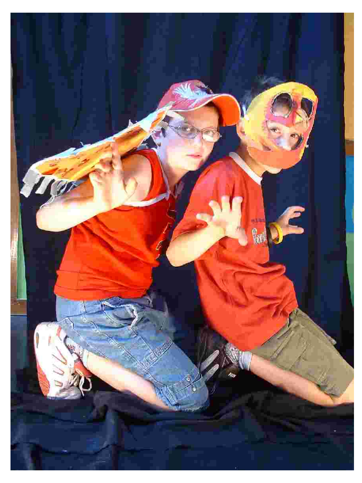
"Creating Monsters" Children from the MUS-E Project in Évora (2005)