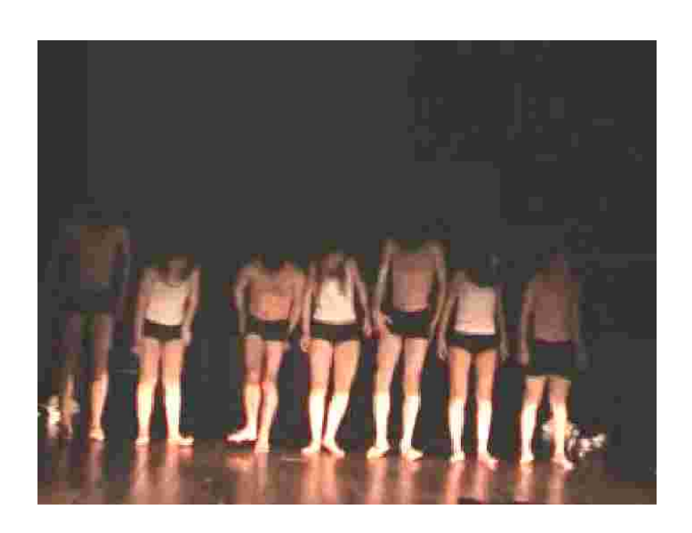
Performance "As mãos pelos pés" Youth theatre Gato SA - Santo André (2003)