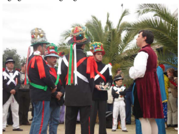
Playing the "Fundamento"