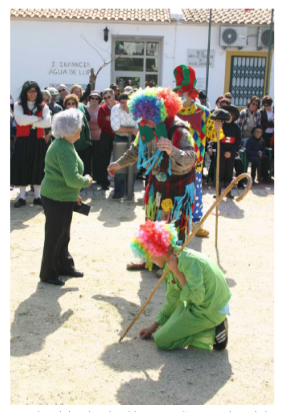
Fund Raising by the Clowns – Community Link