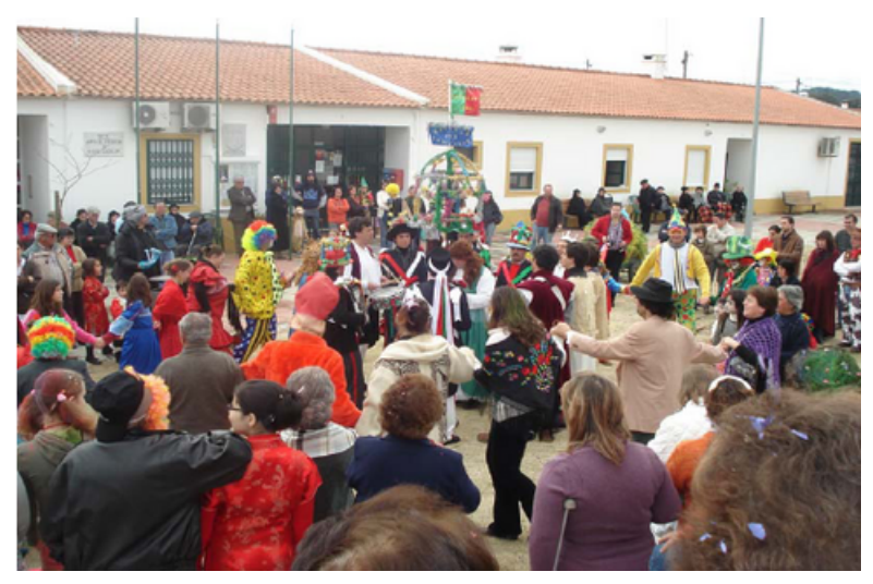
Singing and Dancing Together at the End of "Fundamento"