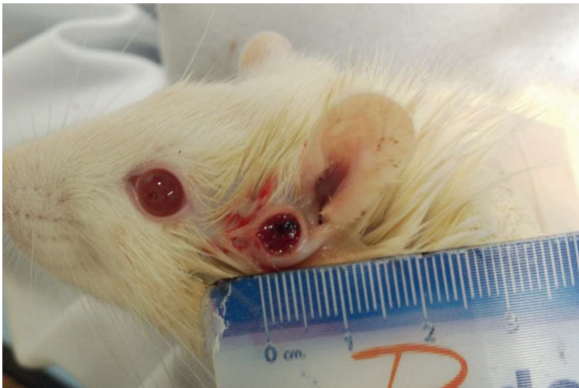
Figure 1. Macroscopic appearance of the Zymbal's gland tumor. It appeared as a 0.5 mm diameter, unilateral, round, ulcerated firm mass ventral to the left ear, at the mandibulo-maxillary junction.

( 23\pm 2^{\circ}\text{C} ), humidity ( 50\pm 10\% ), air system filtration (10-20 ventilations/h) and on a 12/12h light/dark cycle. A basic standard laboratory diet (4RF21, Mucedola, Italy) and tap water were supplied ad libitum . Animals were maintained in quarantine for two weeks and were allowed to acclimatize to the animal facilities conditions for two weeks. After this, they were randomly divided into experimental groups. Each animal was observed individually and weekly to identify changes in behavior or health. At 25 weeks of age (18 th week of the experiment), one animal from the control group, i.e., not subjected to the administration of any substances or manipulations, exhibited a 0.5 cm diameter, unilateral, round, firm mass ventral to the left ear, near the mandibulo-maxillary junction; after two weeks, the mass ulcerated (Figure 1). Focusing on animal welfare, it was humanely sacrificed by