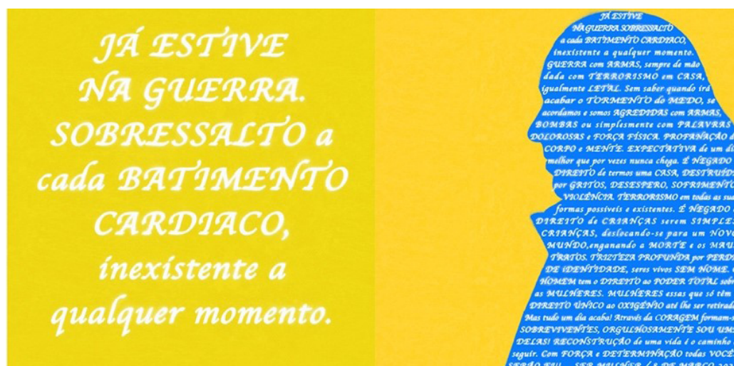
Figure 2. Image of Lab. HERSTORIES, 2022

It is important to note that during the workshops, trying to give the participants a voice and listen to them did not mean that we harboured the expectation that they would all be obliged to speak, as we advocate that everyone also has the right to silence. The participants' responses were very diverse: some brief and fragmented, others complex and extensive.