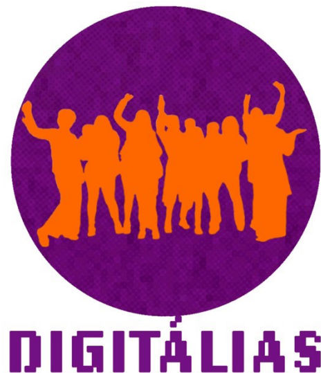
Figure 1. Digitálias logo, 2022

As far as the Digitálias logo is concerned, we came up with the idea during one of the workshops in which the women and their children filmed themselves dancing, as part of our strategy of valuing and empowering them. These performative scenes of bodily expression sought to give women survivors and their children what they are so often denied in society – the chance to express themselves freely and spontaneously. The cameras were made available to everyone present, placed on a tripod in a small indoor garden, where there was no shortage of food and music.