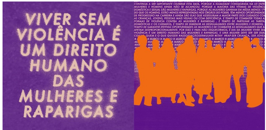
Figure 3. Image of Lab. HERSTORIES, 2022 © Digitálias collective

During the second wave of the feminist movement, women were dissatisfied with the male narratives that controlled and presided over the course of the narrative of historical events. The historical amnesia surrounding women's stories necessitated the coining of the term “Herstory”, which was used with both seriousness and irony. The American thinker and activist Robin Morgan is one of the first to use this term in her work, Sisterhood is Powerful: An Anthology of Writings from the Women's Liberation Movement (1970). It was second-wave feminism, stemming from the women's liberation movement in the 1970s, that questioned and challenged the ways in which knowledge was produced, mainly from a male perspective, with the aim of drawing attention to the ways in which women's experiences were excluded and existing gender inequalities were maintained.