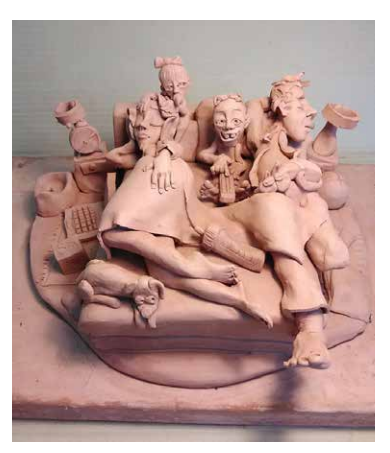
Fig. 11 - Zapping Clay 2009

Fig. 10 Facebook Terracota and acrylic paints 2009