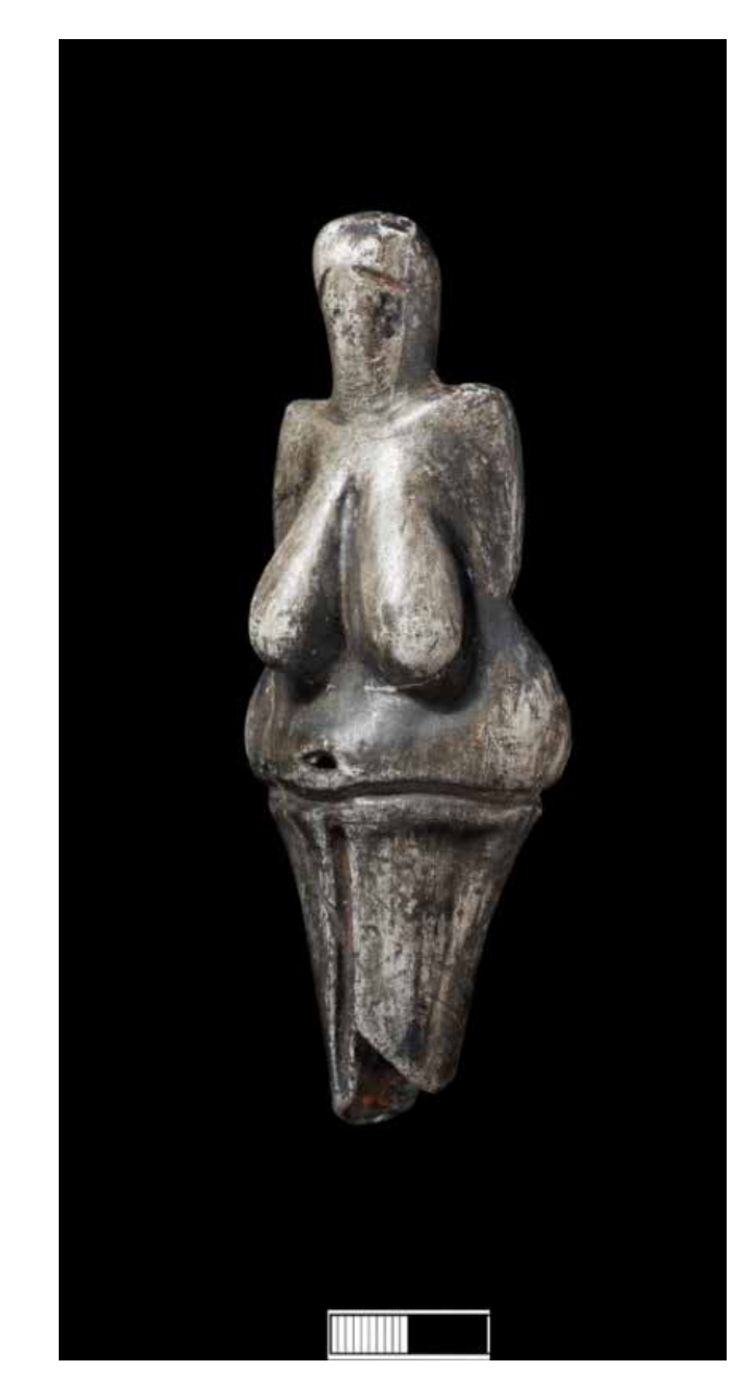
Fig. 2 The Venus of Věstonice<sup>1</sup>, Mixture of charred powdered bone and clay, 111x43mm

Clay was a transition material between thoughtful works and grandiose final sculptures in the 18th century to. In these, for example, the sculptor Machado de Castro (1731, 1822) would not feel so free to be creative. On the other hand, in the simple "curiosities" in clay - what they called the baroque nativity scenes of Italian influence - freedom of expression brought him another creativity and apparently happiness. Cyrilo Volkmar Machado (1748-1823) describes him and other artists referring to the created schools of sculpture in Mafra and Lisbon. It was also from this time, apparently, that clay, as an artistic creative final medium, began to be used, no longer just as a sculptural transition material or votive, funerary coroplastic reproducible object.