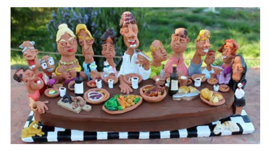
Fig. 13 - Family dinner Terracota and acrylic paints 50x35x30cm, 2009