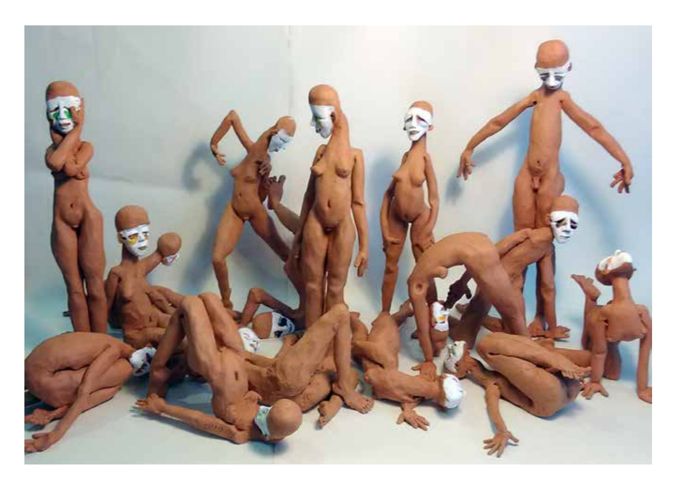
Fig. 7 - From earth to heaven - installation, Terracota and acrylic paints, 100x100cm, 2018

thus rationalized. It was characterized by creative thought directed towards achieving a goal (construction on the theme park).