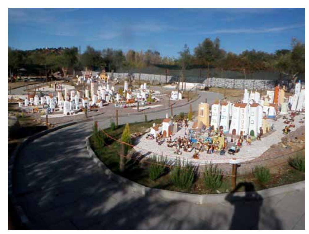
Fig 3 - Aldeia da Terra - Sculpture garden. View 2012