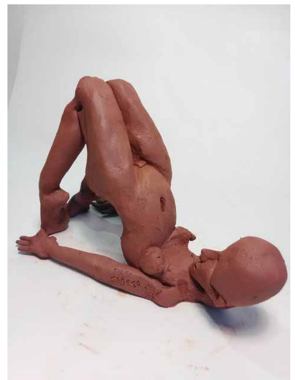
Fig.6 - From earth to heaven - one figure Terracota. 20x10x10cm, 2018

In Cabeça P. (2018) this project was also described as where pointed two distinct sculptural projects and expressions, which are different not only chronologically speaking but also in terms of content and visual language. The thought or rational caricatural expression of the Aldeia da Terra project, and the felt or visceral expression of the From earth to heaven exhibition (Fig.6 and 7).