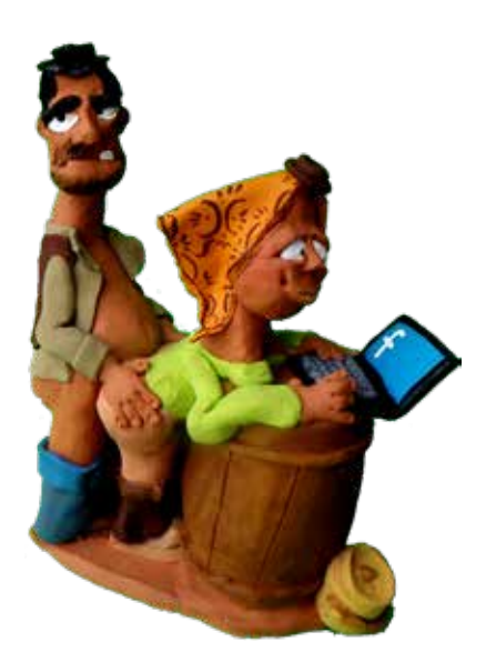
Fig. 10 Facebook Terracota and acrylic paints 2009