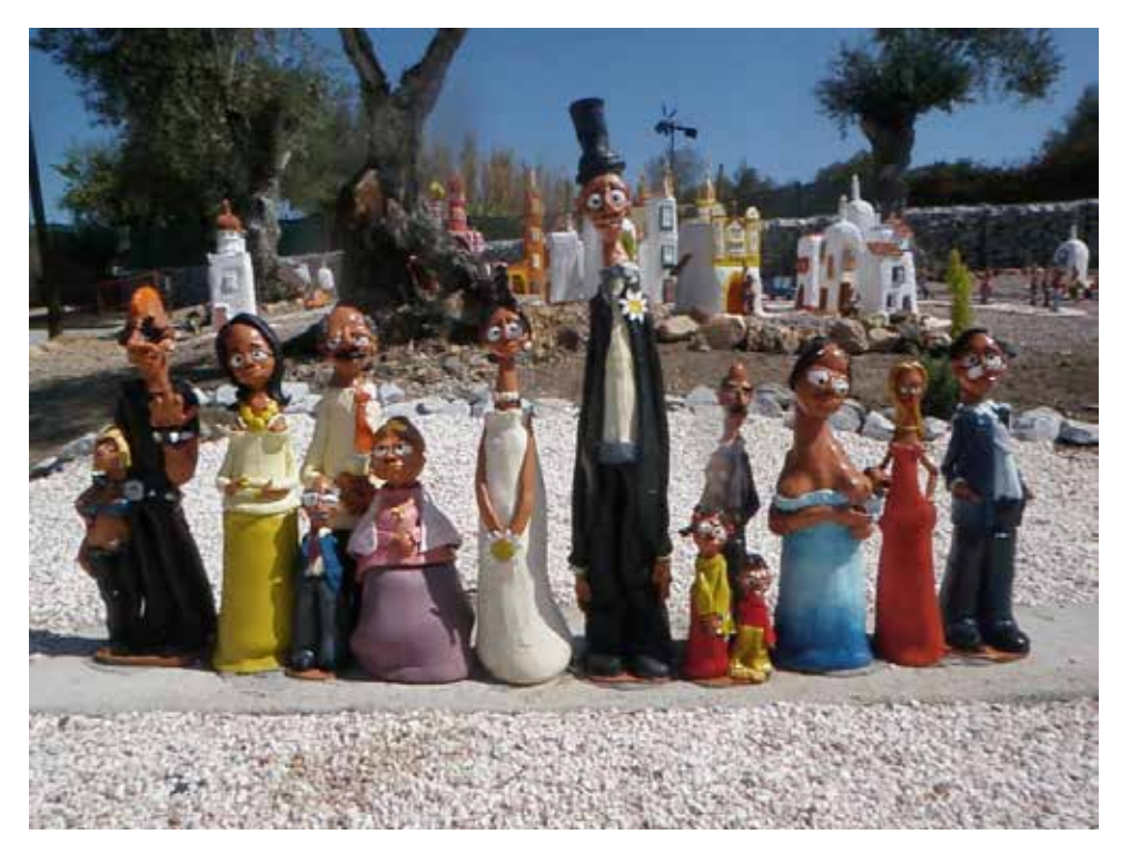
Fig. 4 - Polaroid of the wedding – Aldeia da Terra project Terracota and acrylic paints 200x150x30cm, 2010