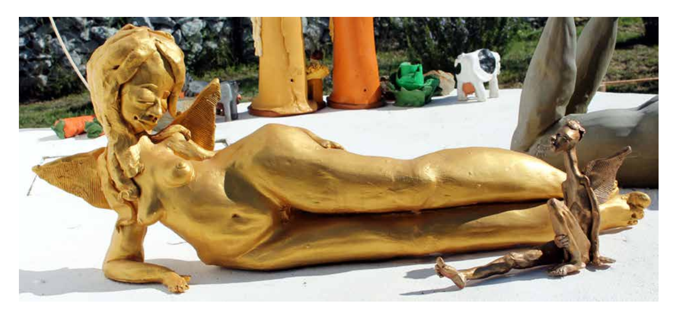
Fig. 9 - Angels, Terracotta and acrylic paints 2009