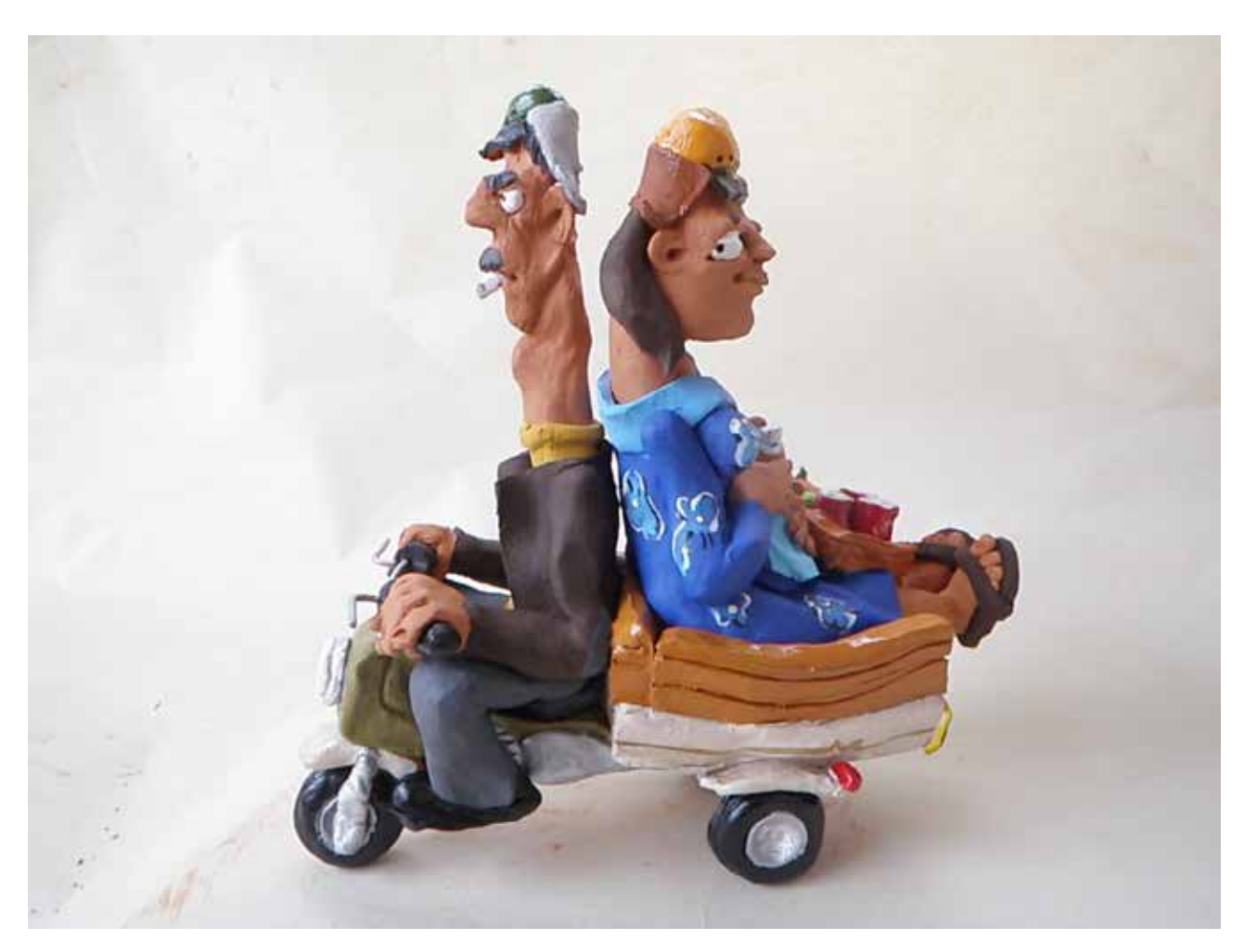
Fig. 8 - Couple on moped, Aldeia da Terra project institutional image, 30x35x20cm, Terracotta and acrylic paints, 2009

This comic-book-like world began to take shape, the difference being that it was three-dimensional and made of clay. Besides this, most times one character suggested another, and so pieces were continually emerging in a whirlwind of creativity.