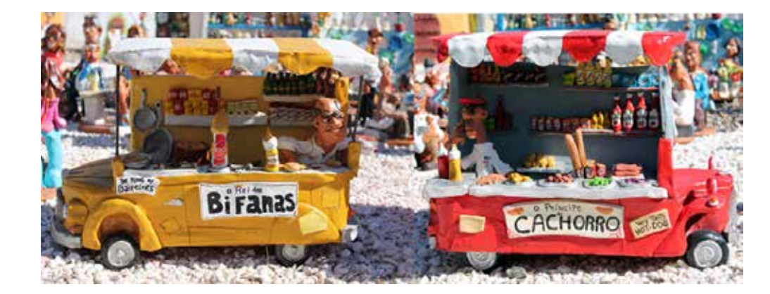
Fig. 14 - Bifanas van versus dogs van Terracota and acrylic paints, 2009