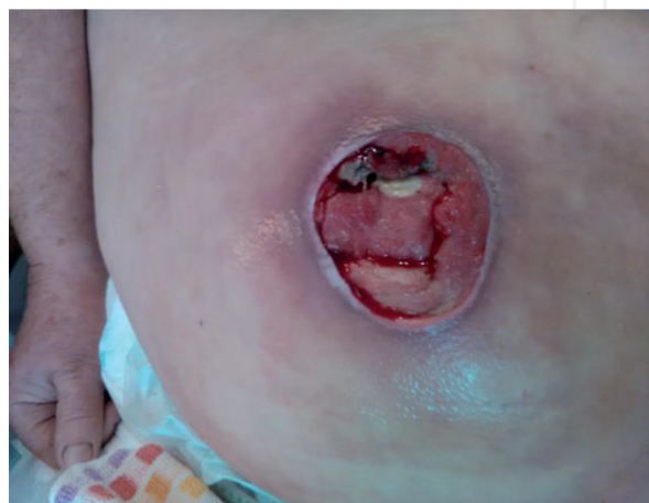
Figure 1. Left trochanter November 2016.

On November 14, 2016, the wound presented: hemorrhage in the wound bed, devitalized tissue, granulation tissue and odor. Despite being referred to the emergency department and a surgery doctor, his wife refused to go. Gelatin sponge dressing, pads and patching, dressing and treatment were initiated twice a day, as well as antibiotic therapy after medical observation. On November 20, 2016 ( Figure 1 ), there was PU with devitalized granulation tissue, without bleeding, with inflammatory signs (redness and erythema) and without odor. The treatment applied was saline [S], ®carboxymethylcellulose single fibers, polyurethane