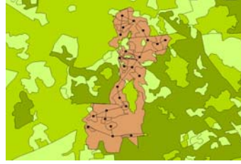
Fig. 1. Map of a section of Portalegre, Portugal. Each closed line forms a polygon. Green polygons: different fuel types; brown polygons: burnt area of a 2017 fire. From the burned area we construct a network, by associating each polygon to a node.