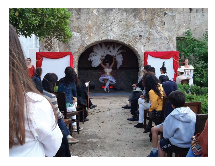
Figure 10. 1 – Garden of Paço de S. Miguel.

The site is real but the performance place is metaphoric, and can provide other fictions and other occupations (Turner, 2000). Beside the queries arising from the proper nature of artistic research (an option for the collective and participatory creation, in all of its parts: direction, costume design, script and dramaturgy), arose the constant need for dramaturgical validation, since the disruption between real/fiction led to incessant searches for writing and rewriting, for its own poetics, inquiring about how and in which way it comes about and feeds on itself.