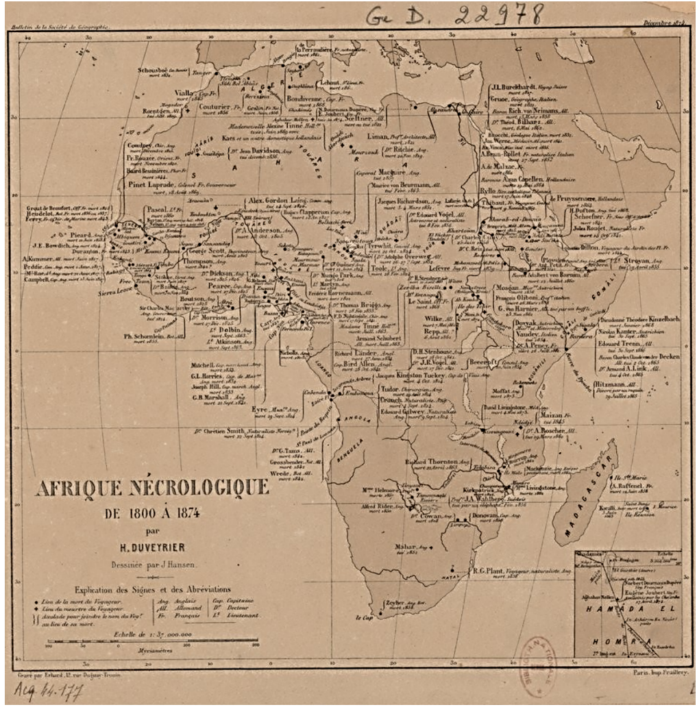
Figure 2. Map of "Afrique Nécrologique" by Henri Duveyrier.

are found on all three maps, which probably attests to the relevance of their contribution to the European knowledge of a portion of Western Africa.