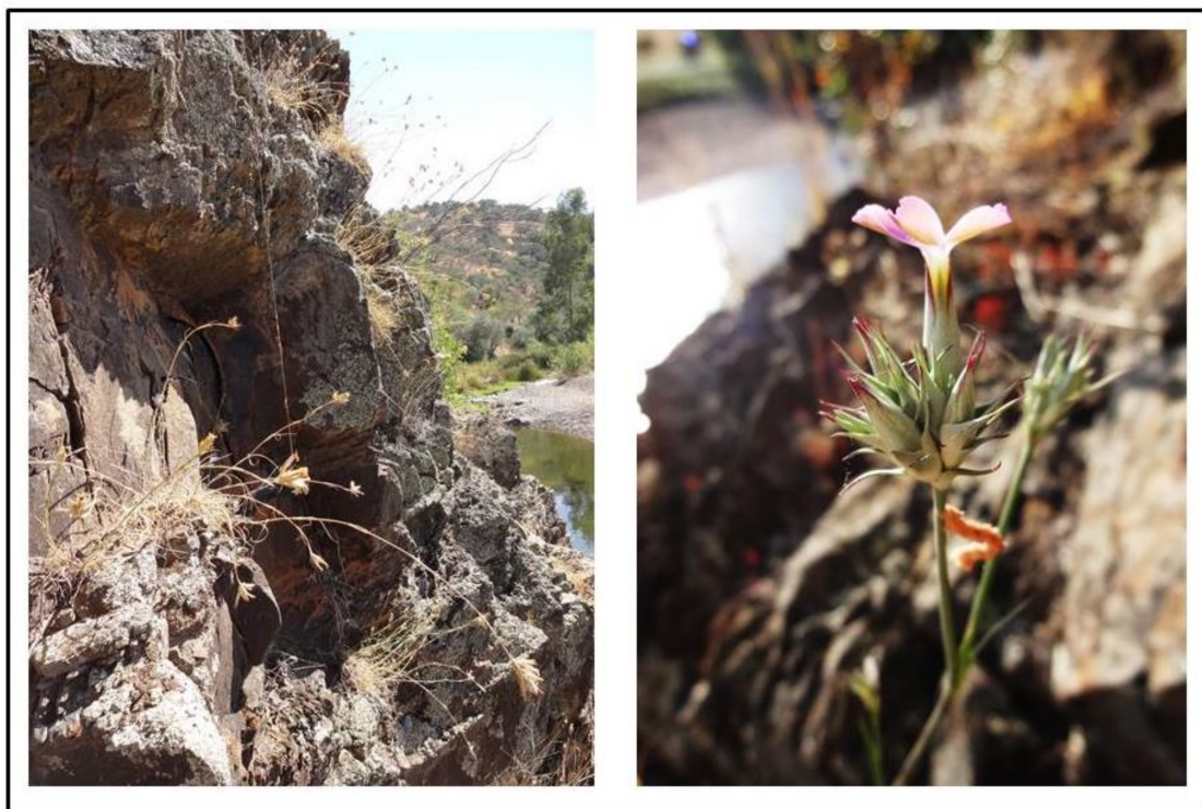
Figure 3. Sanguisorbo rupicolae-Dianthetum crassipedis on rocky cliff fissures in the lower Guadiana basin (Ribeira da Foupanilha, near Vaqueiros—Alcoutim), included in the southwestern part of the Mariánica Range Sector.

The relevés of the new association Sanguisorbo rupicolae-Dianthetum crassipedis (holotypus Table 2, relevé 8) appear to be clearly defined in group A (clusters 1–8; Figure 2). It is a perennial chasmo-chomophytic community, which develops on acid rocky fissures of schist or greywackes and quartzitic outcrops of the Guadiana basin, in the southeastern part of Portugal (East Mariánica District, Mariánica Range Sector). The Sanguisorbo rupicolae-Dianthetum crassipedis is an association characterized by Dianthus crassipes and Sanguisorba rupicola [41] (Figure 3). As shown in Table 2, the floristic composition also contains other chasmo-chomophytic species from the Phagnalo saxatilis-Rumicetea indurati class, such as Phagnalon saxatile and Rumex induratus . The rupicolous character is emphasized by the presence, in the companion species group, of chasmo-phytic elements from the Asplenieta trichomanis class, such as Cheilanthes maderensis , Cheilanthes guanchica and Cosentinia vellea . Regarding the xerophilous position, this new association develops on the most exposed sector of the cliffs or crests and is distributed in holm oak woodland domains of the Myrto communis-Quercetum rotundifoliae or, in the driest siliceous areas of the lower part of the Guadiana valley, on potential areas of the sclerophyllous shrubs of Juniperus turbinata , from the Phlomido purpureae-Juniperetum turbinatae .