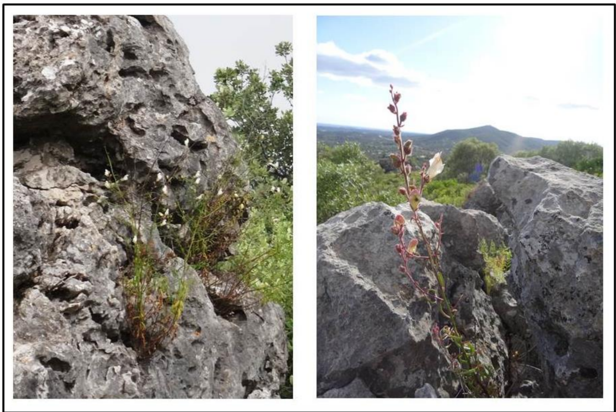
Figure 4. Antirrhinetum onubensis on rocky fissures of limestones in the Algarve and Monchique Sector—Barrocal algarvio (left: Varejota, Parragil—Loulé; right: Cerro da Cabeça, Moncarapacho—Olhão).

The new association Antirrhinetum onubensis (holotypus Table 3, relevé 6) occurs in the thermomediterranean, dry to sub-humid belts of the Algarve District (Algarve and Monchique Sector), on sub-coastal cliffs or rocky fissures of limestones from southern Portugal (Barrocal algarvio reliefs) (Figure 4). Thus, Antirrhinetum onubensis is a calcicolous association developed in potential areas of the edaphoxerophilous woodlands dominated by Quercus rotundifolia ( Rhamno oleoidis-Quercetum rotundifoliae ), Juniperus turbinata ( Aristolochio baeticae-Juniperetum turbinatae ) and Ceratonia siliqua ( Vinco difformis-Ceratonietum siliquae ).