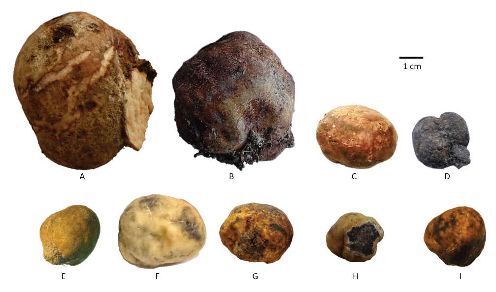
Figure 3. Terfezia species collected in the present work A T. arenaria B T. fanfani C T. cistophila D T. grisea E T. dunensis F T. extremadurensis G T. lusitanica H T. pini I T. solaris-libera.

and associated with C. monspeliensis and C. creticus (and no information on soil type is available). The remaining specimens are from Portugal and Spain and are linked to C. salviifolius and C. ladanifer. T. dunensis is so far represented by four specimens and only one with soil features information (Table 1). The two samples from Huelva (Spain) cluster together and are linked to Cistaceae . The other two samples are the "unclassifiable" GenBank AF396864 (Louro et al. 2019) and a sample from South Portugal that is either associated with Cistus or Pinus .