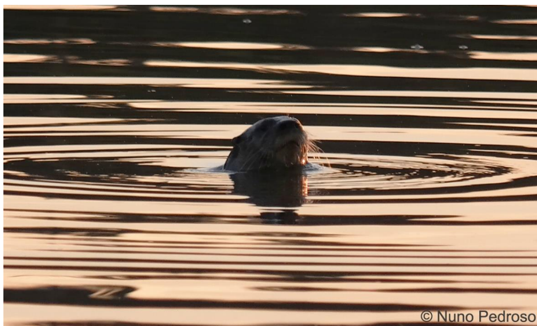
Figure 7. Neotropical otter observed in Paranapanema river.

Besides talks, six meetings were promoted with stakeholders and local decision makers including mayors, city councilmen and Federal deputies. In the course of these, they were informed about the environmental concerns identified during the course of our work and discussions followed on possible future actions to diminish environmental degradation in the region. Occurrence of antimicrobial resistance in aquatic environments is an important concern of public health, since aquatic environments are used by local inhabitants in their daily tasks (e.g. fishing, transport, leisure, urban use). Several stakeholders and representatives of local governments became especially interested in this matter as they have been informed about how the use of not only antibiotics, but also insecticides and fertilizers may affect aquatic environments and human health by excessive use, runoff from facilities and cattle defecation in rivers. Interest was also shown on further discussions on how to