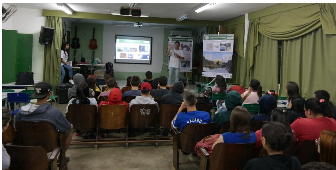
Figure 5. Talk in Ivens Vieira State School, Angatuba.

In each event, attendees also provide us information about specific areas where the riparian vegetation is decreasing and new threat factors such as the appearance of non-native species of fish that are competing with native ones, unbalancing fish communities.