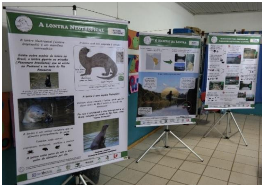
Figure 3. Banners (from left to right: The Neotropical otter, Otter habitat, Good practices towards aquatic environments).

The distributed handouts indicated a list of actions to mitigate further water contamination and pollution, riparian degradation and encourage the recycling of urban waste and the collection of medications and drugs that are no longer used by the population.