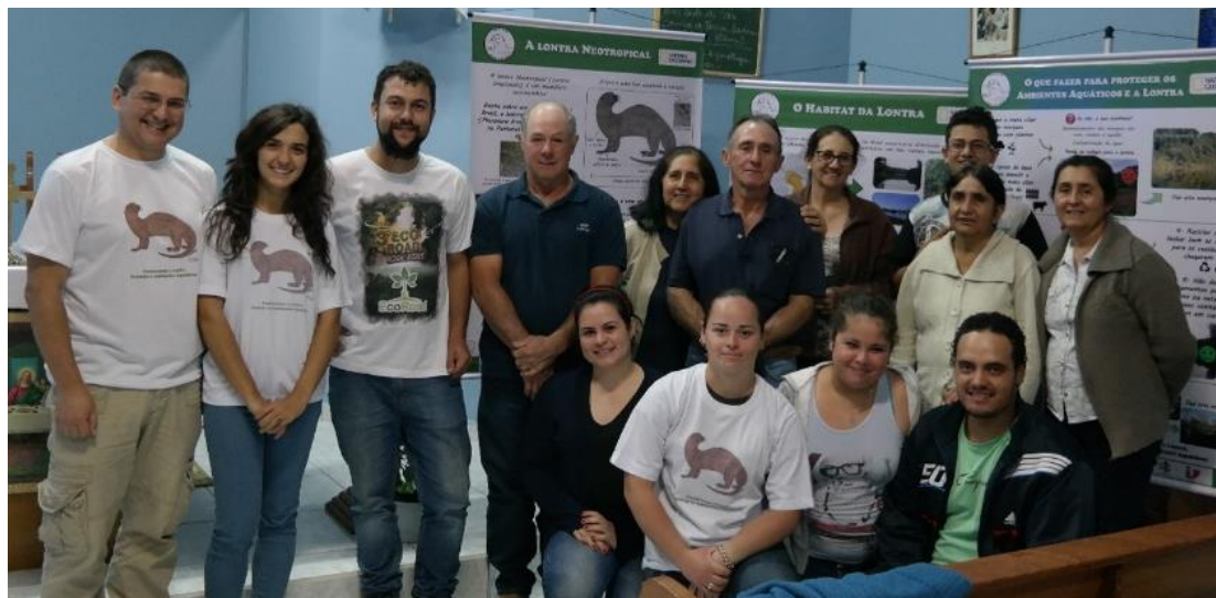
Figure 4. Project members and attendees of a talk in Leites village, near Angatuba city.