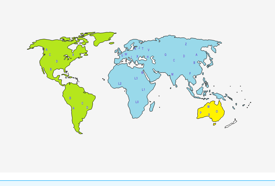
Figure 2 Representation of the geographical origin of the main mtDNA haplogroups, based on Lott et al. (2014). Full-size IDOI: 10.7717/peerj.7314/fig-2

containing published human mtDNA variation along with geographic and disease specific variants. Currently, Mitomap is manually curated, frequently updated and a functionally rich resource, presenting high-quality human mtDNA data for clinicians, investigators and geneticists ( Ruiz-Pesini et al., 2007 ). Mitomap has three main categories for usage. It contains some background information regarding the human mitochondrial DNA, such as the general representation of mtDNA, haplogroups and their frequencies and illustrations of mtDNA, among others. Furthermore, users can also find information about other mtDNA-specific databases, tools and useful resources.