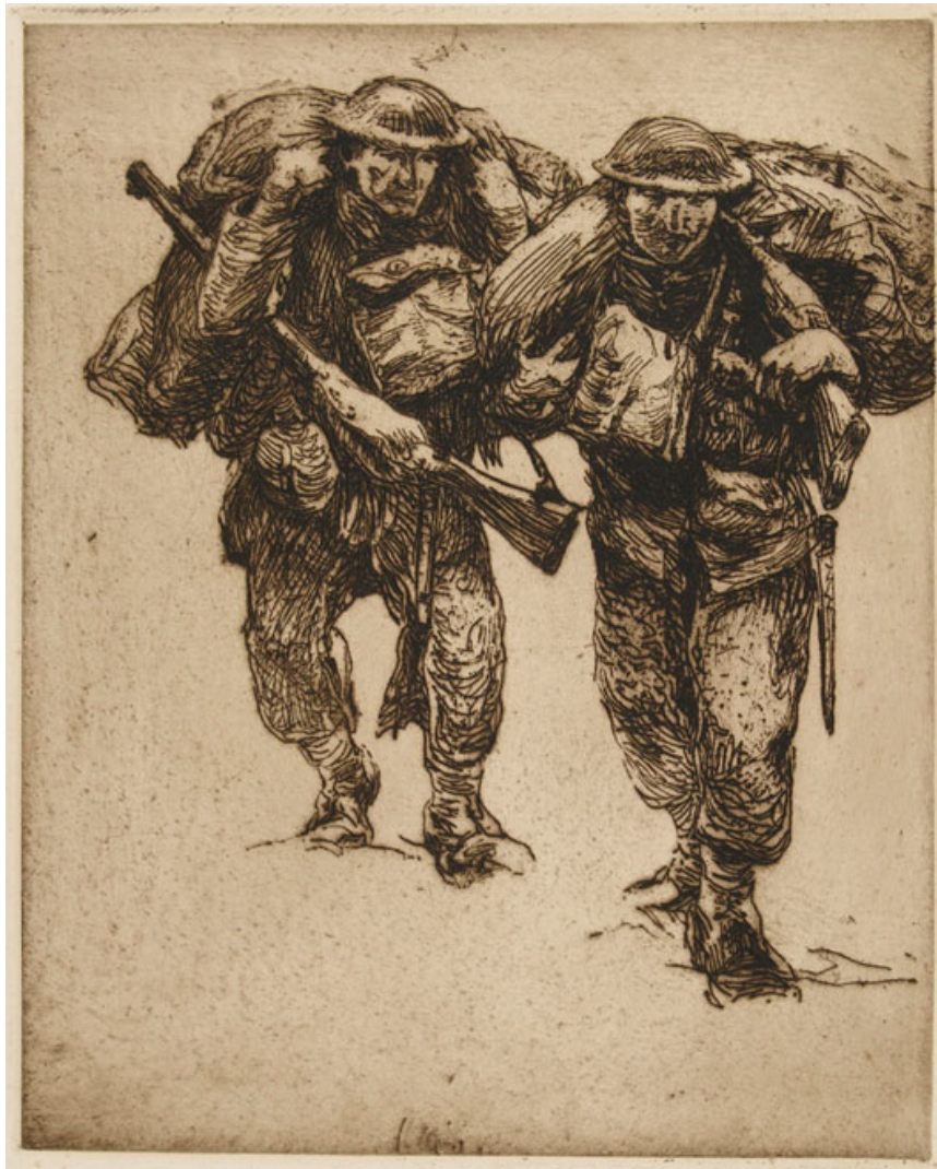
Fig. 6 Duas ordenanças de Infantaria 11 (Two ordinances of 11th Infantry). Etching on paper, 30.8 × 24.5 cm. 1918

soldiers in the new trench warfare, showing them as moving ghosts. It should be noted also that the soldiers walk in an inverse direction to the viewer, that is, from right to left, as if they were walking backwards. They surrender, as the title states, and remove any trace of hope in the future. They are condemned beings and everything that surrounds them points to it. Yet again, the “glorious effort of the Portuguese people” 17 is underlined.