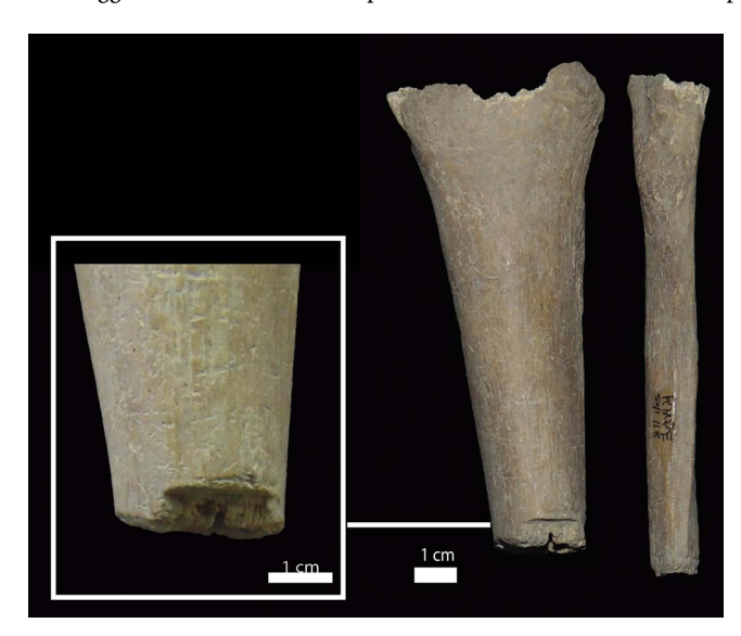
Fig. 5. Right fibula and tibia showing evidences of cut observed in skeleton RMPE 118. A false start is noticed in the tibia.

Except for the lesions in the forearms and leg bones, no other evidence of perimortem trauma was found in the skeletons surveyed. Cut marks on the distal extremities of the forearms and lower leg bones, with severing of hands and feet, suggests an amputation of the extremities likely happening around the time of death. The lesion's features suggest that these are compatible with the action of a sharp