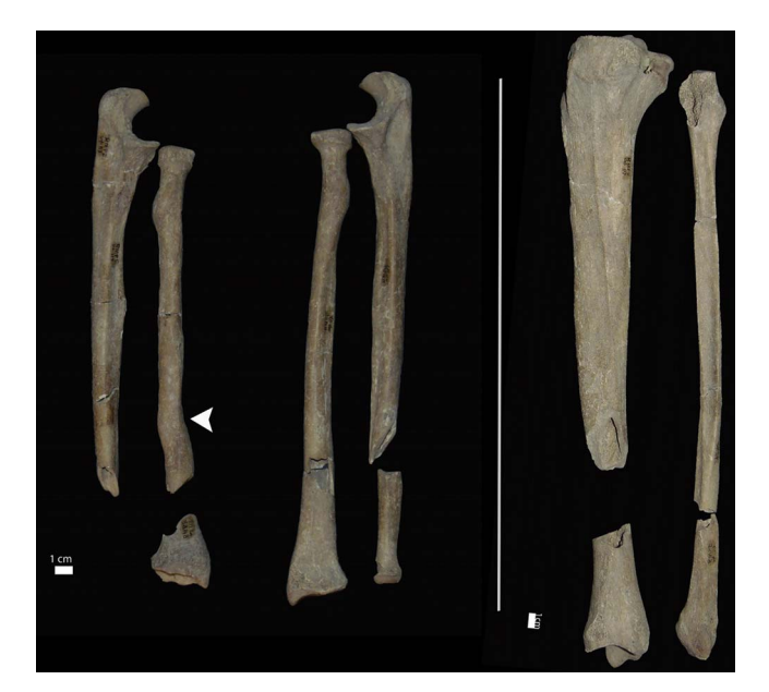
Fig. 4. Skeleton RMPE 117 shows bilateral evidence of a cut affecting the upper limb (distal portion) and distal portion of the left tibia and fibula. It is also evident a callus of a remodeled fracture in the diaphysis of the left radius (arrow head).

they were fragmented or incomplete at the time of laboratory data collection