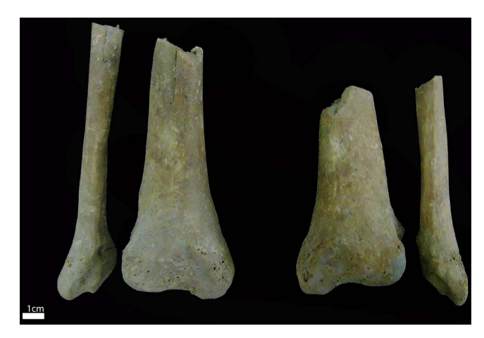
Fig. 2. Oblique cuts in the distal third of the diaphysis of the fibulae and tibiae noticed in the skeleton RMPE 116.

Skeleton RMPE 116 exhibited morphological features compatible with a male individual based on cranial and pelvic morphology, and it is the youngest of the three individuals. Third molar root apices were still open (Mincer et al., 1993), the distal epiphyses of the ulna and radius were not completely fused, and the distal epiphyseal line of the