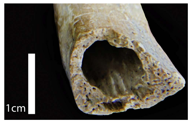
Fig. 3. Striations parallel to the kerf floor in the right distal extremity of the fibula, observed in the skeleton RMPE 116.

Skeleton RMPE 117 had most of the bones present (Fig. 1), however