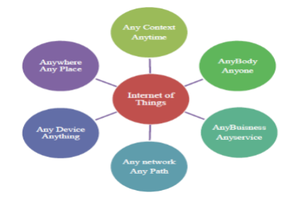
Figure 1. Dimensions of IoT [10]

According to these definitions, Figure 1 shows the dimensions of IoT.