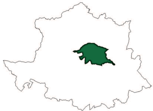
Figura 1: Provincia de Cáceres y situación del Parque Nacional de Monfragüe y su Zona Periférica de Protección.

El estudio de los anfibios en el Parque Nacional de Monfragüe se puede considerar muy escaso pues, a excepción de un trabajo no publicado (Muñoz, 2002), no existe ninguno que haya tenido por objeto el estudio de este grupo de vertebrados en este espacio protegido. Varios trabajos recogen datos del mismo pero con un área de estudio mayor (Barberá et al. , 2006; Muñoz, 2002; Muñoz et al. , 2005; Muñoz et al. , 2012; Palomo, 1993). El presente trabajo tiene Para ver Anexos ir a < http://www.herpetologica.es/publicaciones/ >